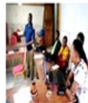
Project EnGard with implementing partners

Please, call us (see page 1) before making payment.