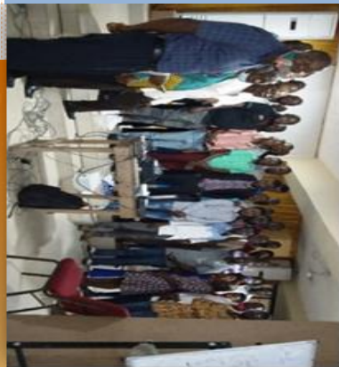
GRADUATES & FACILITATORS - 2019